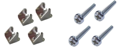
Panel clip * 4 and M4 x 30L Screw * 4